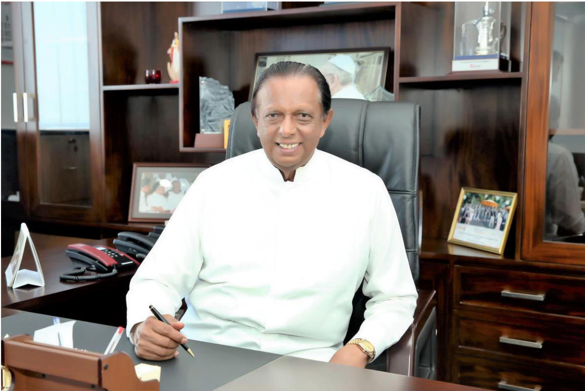
Image 2: Minister of Tourism, Wildlife and Christian Religious Affairs, Hon. John Amaratunga.